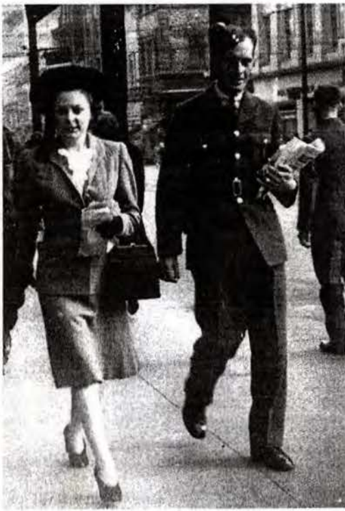
YONGE ST., TORONTO, ONT. 1943