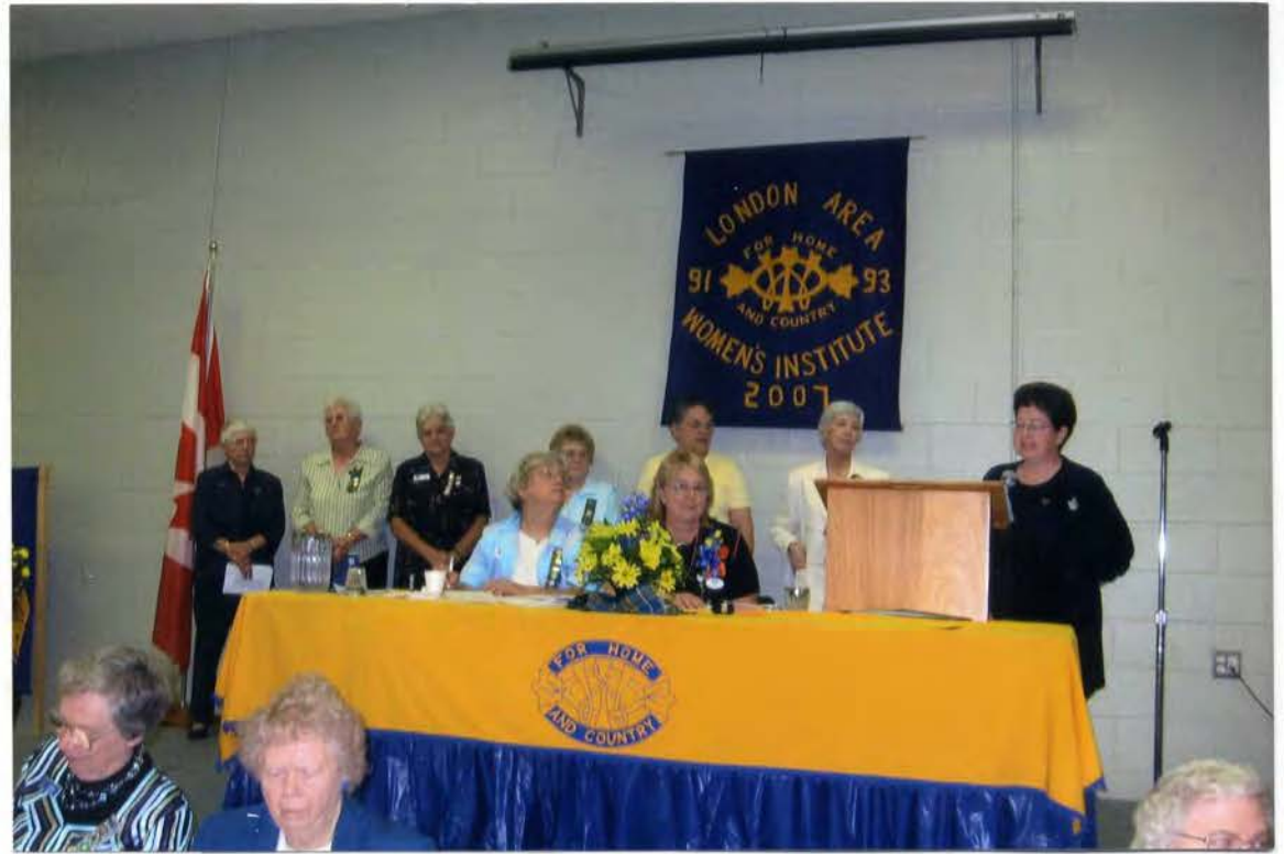
London Area Womens Institute Officers

PERTH SOUTH, HURON SOUTH, HURON WEST OXFORD DISTRICT